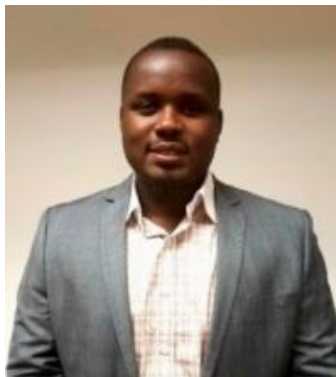
Buyer of the Year