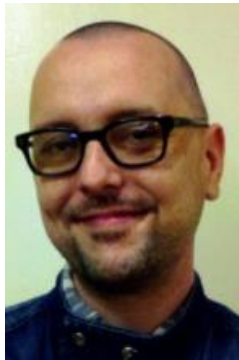
Manager of the Year

Congratulations to our 2020 Columbia Chapter Manager and Buyer of the Year!!