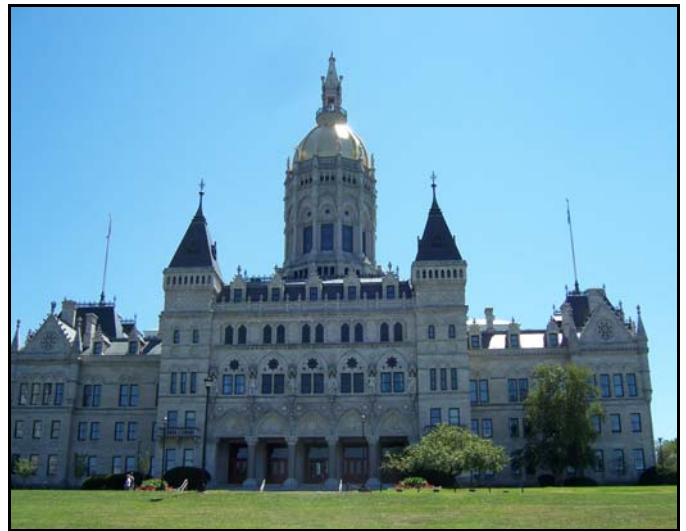
State Capital Building, Hartford, CN

My opportunity came by requesting my name to be added to the list of CPPB certificate recipients. Then I waited my turn in line. I encourage recent CPPB recipients to sign up. It's well worth the wait!