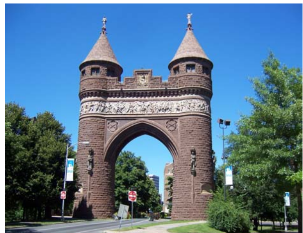
Soldier's and Sailor's Memorial Arch in Hartford, CN