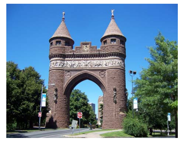
Soldier's and Sailor's Memorial Arch in Hartford, CN