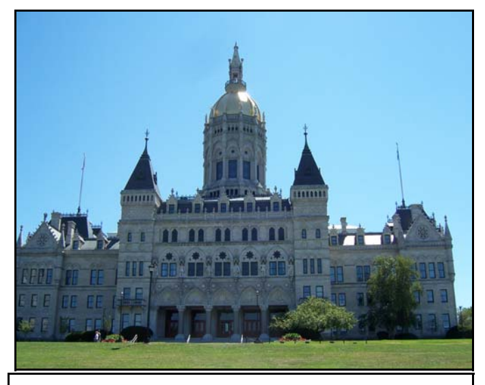
State Capital Building, Hartford, CN

Oregon State Legislature website www.leg.state.or.us