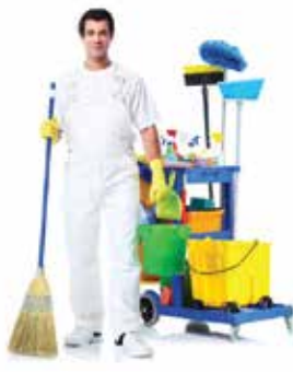
Building Service Contractors