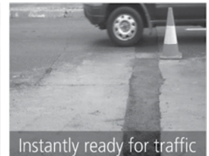
Instantly ready for traffic

Do it right the first time. Patch potholes or close utility cuts permanently.