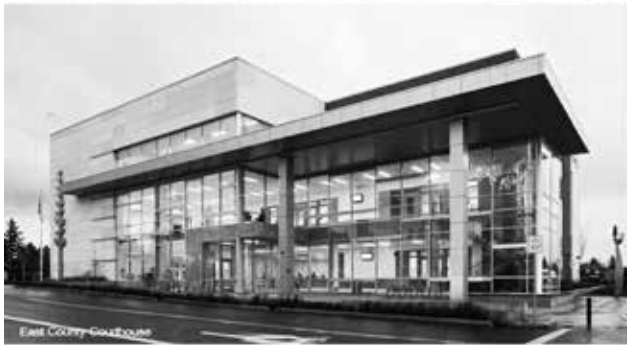
East County Courthouse

720 NW Davis Street, Suite 300 Portland, Oregon 97209 P: 503.221.1121 F: 503.221.2077