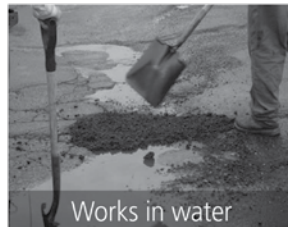
Works in water

Permanent Pavement for Potholes, Paths and Parking.