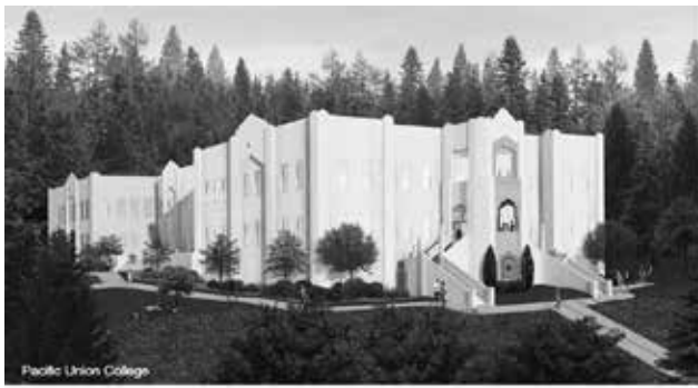
Pacific Union College