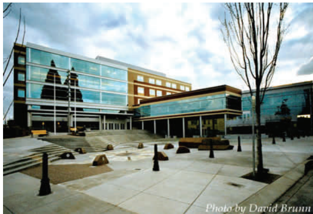
City of Hillsboro Civic Center www.ci.hillsboro.or.us

“When was the last time your purchase changed a life?”